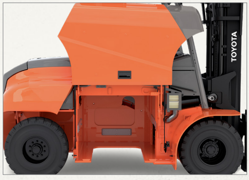
Open chassis design with side panel facilitates lateral battery exchange.