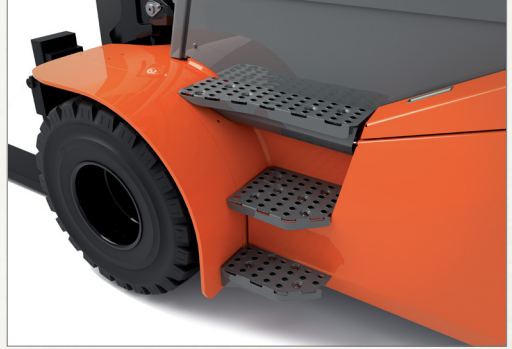
Large entry window with wide steps and double driver assist grips ensure fatigue is minimized in applications that require repeatedly getting in and out.