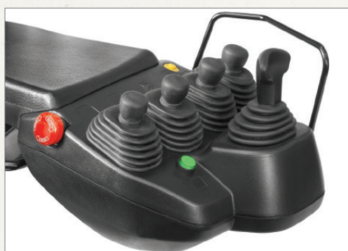
\label{eq:minilevers} \mbox{Minilevers in the armrest are intuitive and easy to use.}