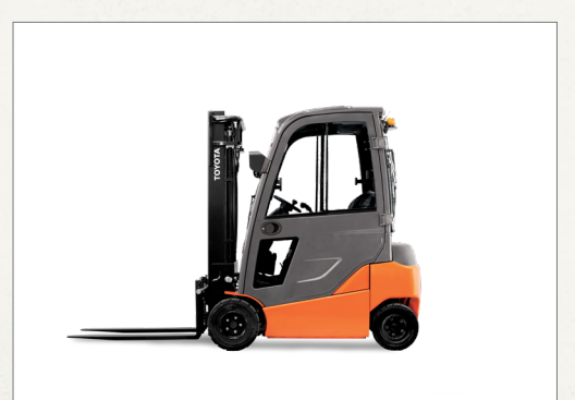
Cabin options provide weather protection, increased comfort and enhanced safety.