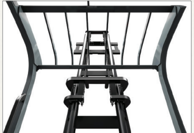
Visibility FV mast provides a clear view at all angles.