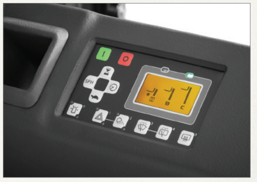
Lift height presetting saves time and effort for the driver.