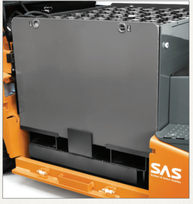
Battery mounted on optional rollerbed for easy extraction. Alternatively, fork pockets allow another forklift to remove the battery.