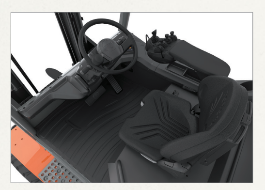
The spacious full floating driver compartment with minimal vibration and low noise offers the driver a comfortable work space.