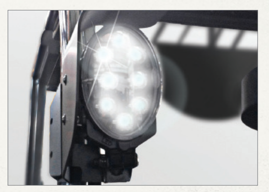
Powerful and efficient LED working lights allow work to continue in unlit areas or at night.