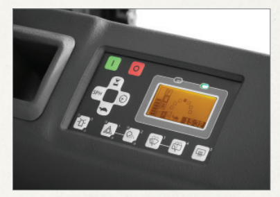
Multifunction display gives key information at a glance, and allows the parameter settings to be adjusted to suit the needs of the application.