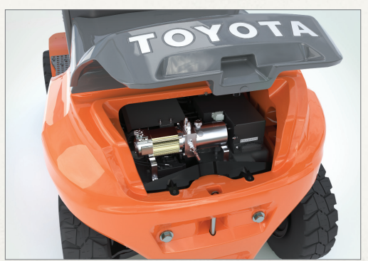
Easy access to main service components.