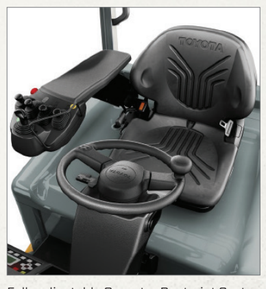
Fully adjustable Operator Restraint System (ORS) with side-wings and lumbar support.