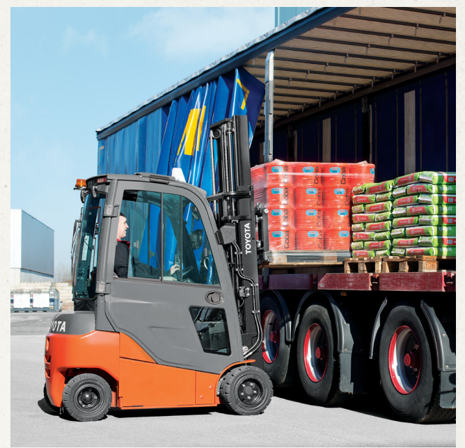
Available Fall 2021